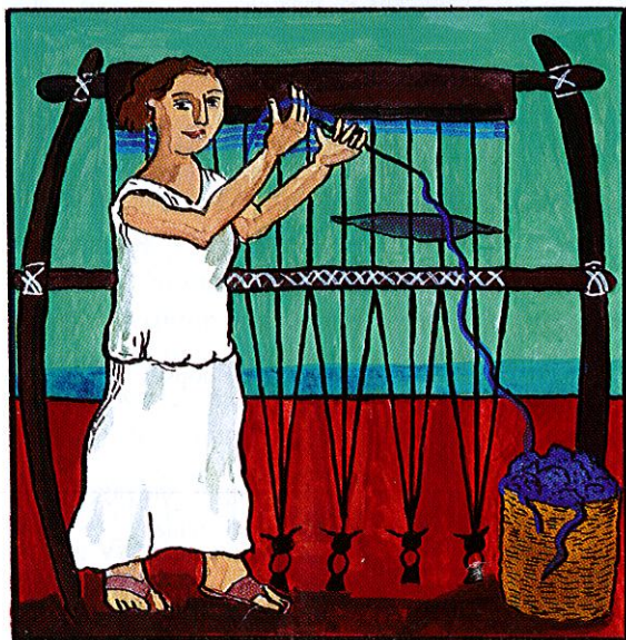
Scintilla est fēmina Rōmāna; in casā labōrat.